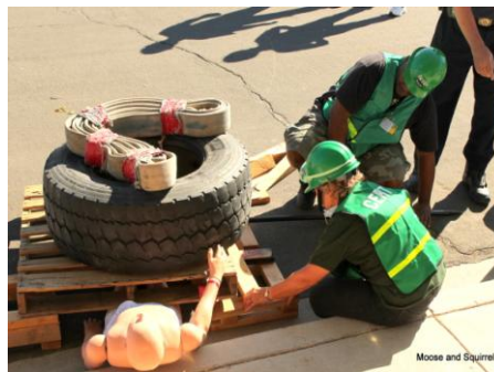
Barstow C.E.R.T. team members practice cribbing during a disaster simulation

For more information and to sign up for classes, see us on the web at: